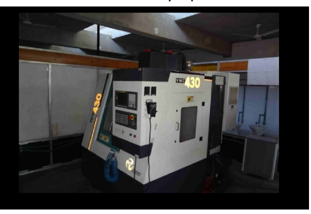
CNC Operator – Vertical Machining