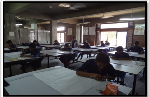
Draughtsperson (Interior Design)